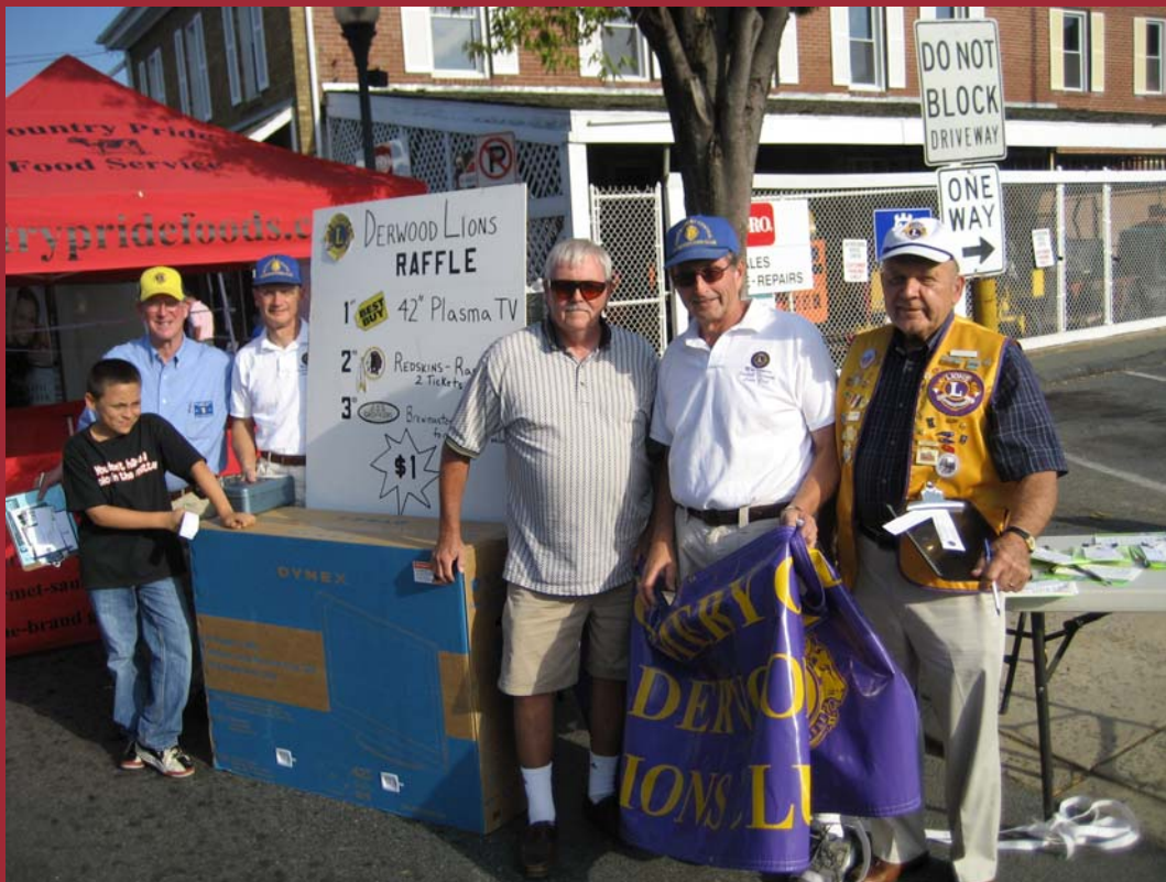
LEOs and Lions working together in harmony at Celebrate Gaithersburg in Olde Towne.